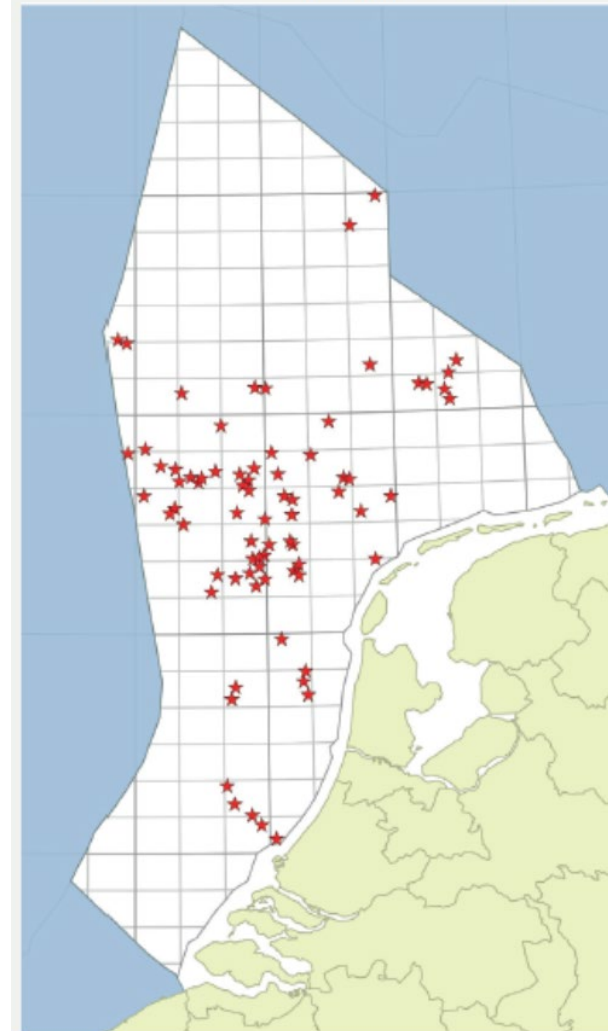
Ligging van alle opslaglocaties die bijdragen aan de totale praktische opslagcapaciteit op zee.